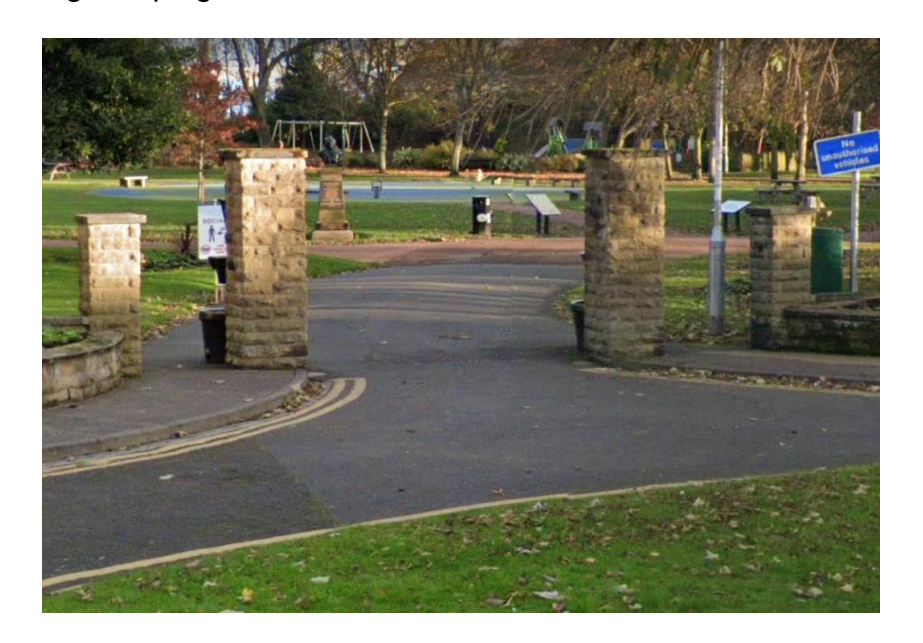
Old existing entrance